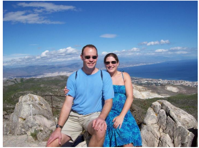
Enjoying the view from the mountaintop in Malaga (with a little help from the cablecar)