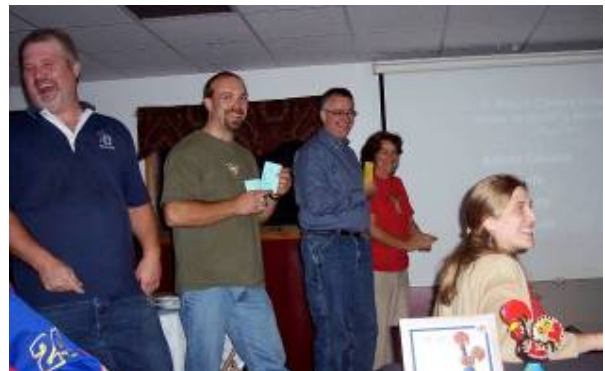
Trivia fun with the folks at Gearhartville