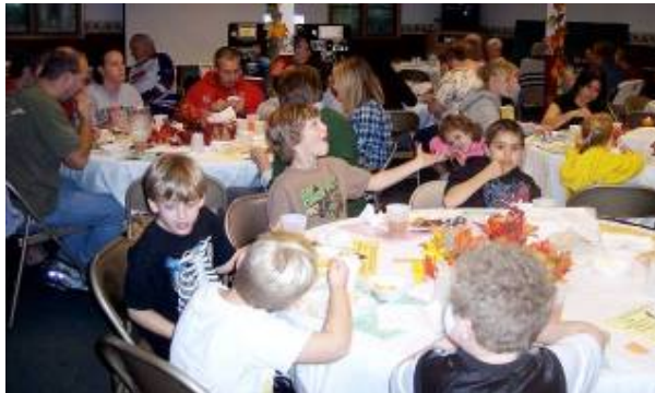
A lively crowd turned out to hear us speak at the Gearhartville missions conference kick-off (a pig roast!).

Thank you to those churches that have embraced us with your warm hospitality, encouraged us with your tears and prayers, and inspired us through your sacrificial giving. We count it an honor to be your ambassadors for Christ in Europe.